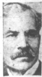
Prime Minister Ramsay MacDonald

FOUR resolutions or recommendations devised by the committee of finance ministers and adopted by the seven-power conference in London, comprised the total results of the conference, and it was the opinion of observers that little if anything had been done for the actual relief of Germany.