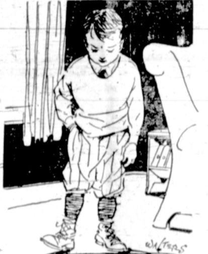
His Good Shoes Were Not So Very Good.

Christmas had passed and all the boys and girls were talking about the presents they had received. Tommy's mother had been sick during the fall and his father had been out of work for several weeks and