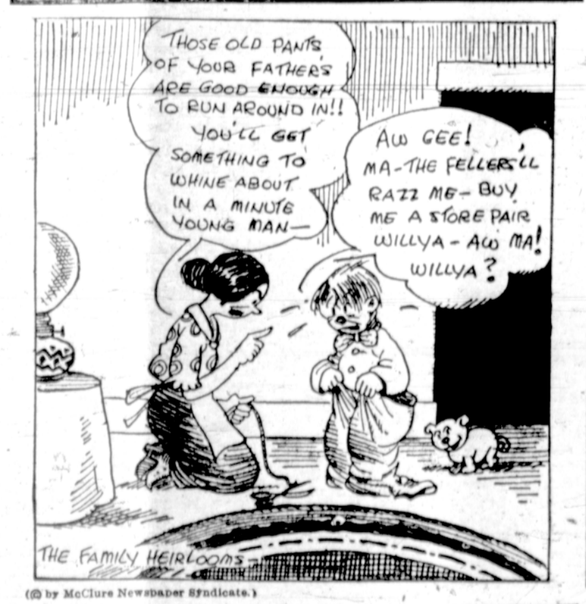
THE FAMILY HEIRLOOMS