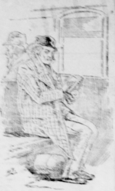
HE CAUTIONNLY SLIPPED THE PENCIL FROM HIS POCKET TO RISK.

once more in the paper, eagerly, but cautiously, slipping his hand in the pocket and breaking the threads where