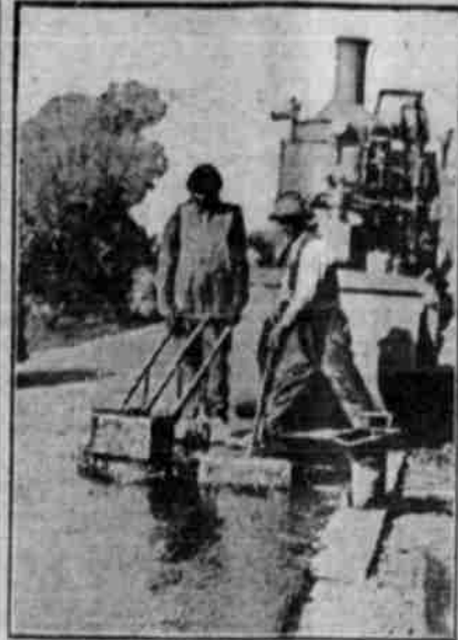
Application of Seal Coat in Progress.

"It is up to the federal, state and local governments to save our highways," remarked John K. Tener of Pennsylvania, former governor, president of the Permanent Highways corporation of New York. Governor Tener declared that it is a military necessity for the proper authorities to protect the roads. "We must preserve the roads of the country, and particu-