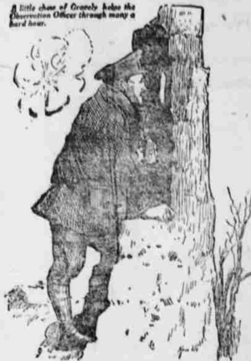
A little dose of Gravelly helps the Observation Officer through many a hard hour.