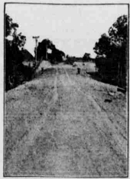
Sand-Clay Road, If Well Kept, Is Satisfactory for Moderate Traffic.

The procedure adopted calls for the submission of an application, known