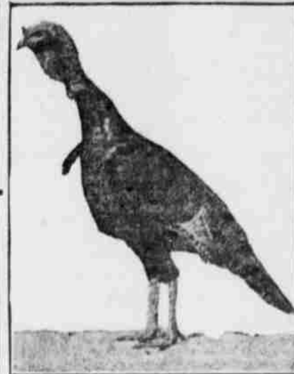
Profitable Type for Any Farm.

The small number of turkeys per farm in the United States is surprising. According to the census of 1910, which is the latest census that has been taken, only 13.7 per cent of the total number of farms reported any turkeys at all and on these farms reporting turkeys, an average of but