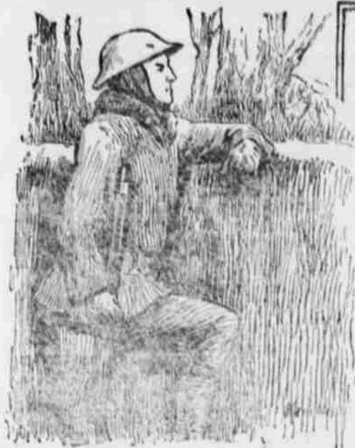
Here's one of the times when a fellow soldier thought of the friend who sent him that pouch of Real Gravelly.