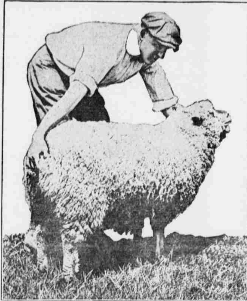
RIGHT WAY TO MOVE SHEEP.