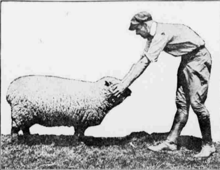
DRAGGING A SHEEP—WRONG WAY.

(Prepared by the United States Department of Agriculture.) These two photographs show the wrong way and the right way to move a sheep—especially fat sheep. The sheep has a delicate frame and its skin is sensitive. Rough handling, therefore, particularly in caring for breeding animals, may do serious harm.