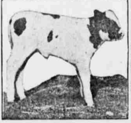
Young Holstein Calf.

Procure from a druggist a stick of caustic soda or caustic potash—it usu-