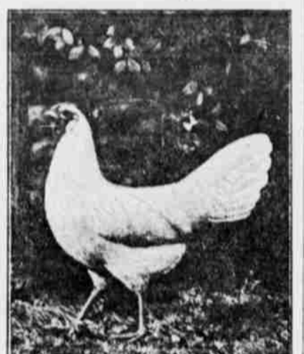
White Leghorn Hen.

Every farmer can raise more and better poultry and do it far more profitably by disposing of all surplus males, by keeping only the yearling hens, and the earliest and best-matured pullets, thus keeping no dead-ends or "slackers" to consume what should go to profitable producers. It is a crime to dispose of a laying hen or a pullet that is just about to lay. Keep the hen house neat and clean. Repair the roof, the windows, and stop any direct drafts that are possible by knot holes or cracks. Too much glass and not enough open front is bad. Write your state experiment station for needed information. Every state in the Union except Florida and