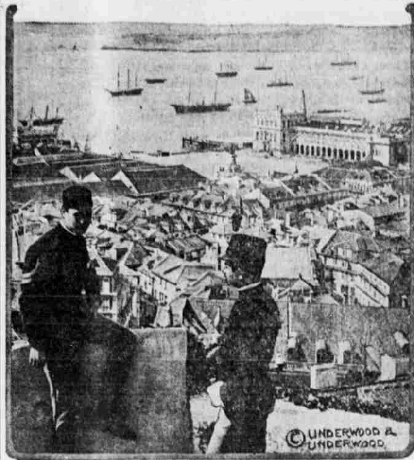
Lisbon's Beautiful Harbor.

PORTUGAL, the most recent nation to be drawn into the maelstrom of the European war, was once a part of the ancient Roman province of Lusitania, says a bulletin issued by the National Geographic society.