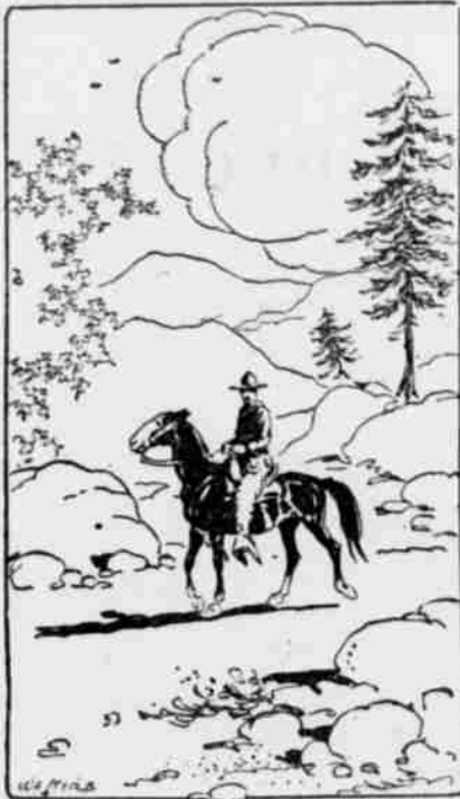
Rode Slowly Down the Valley.

unsigned message asking him to be at the railway depot at a certain hour, to meet the train. And he had gone, to find Jim Tremont waiting there. Jim was passing through on his way to California, he told him, and he had heard he was in that part of the country. Did Will know that his father was dead and he was the sole heir to five million dollars? He had better write home quickly, because everyone was searching for him, and he had only heard of his address by chance.