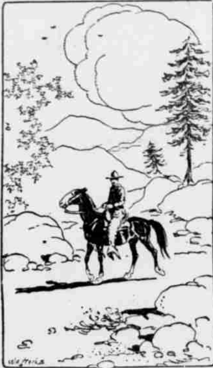
Rode Slowly Down the Valley.

unsigned message asking him to be at the railway depot at a certain hour, to meet the train. And he had gone, to find Jim Tremont waiting there. Jim was passing through on his way to California, he told him, and he had heard he was in that part of the country. Did Will know that his father was dead and he was the sole heir to five million dollars? He had better write home quickly, because everyone was searching for him, and he had only heard of his address by chance.