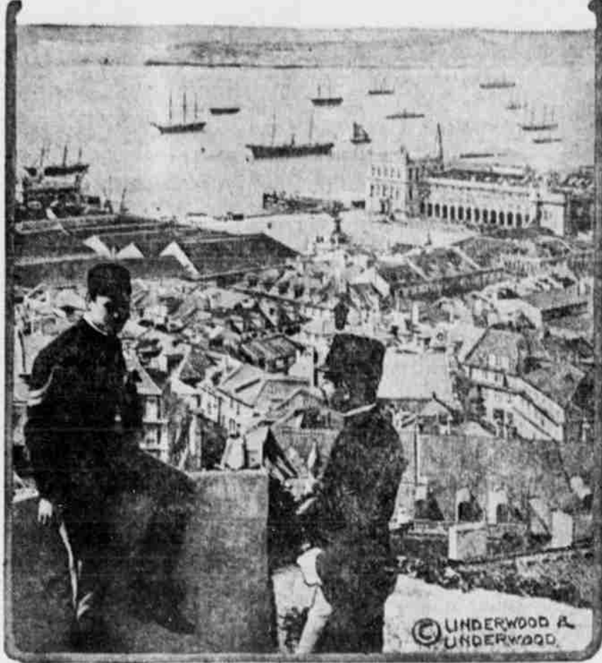
Lisbon's Beautiful Harbor.

PORTUGAL, the most recent nation to be drawn into the maelstrom of the European war, was once a part of the ancient Roman province of Lusitania, says a bulletin issued by the National Geographic society.