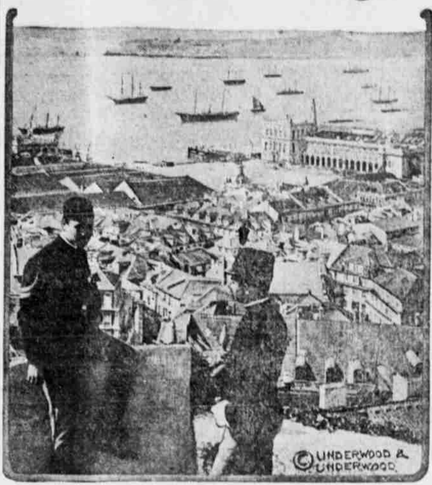
Lisbon's Beautiful Harbor.

PORTUGAL, the most recent nation to be drawn into the maelstrom of the European war, was once a part of the ancient Roman province of Lusitania, says a bulletin issued by the National Geographic society.