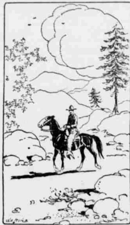
Rode Slowly Down the Valley.

unsigned message asking him to be at the railway depot at a certain hour, to meet the train. And he had gone, to find Jim Tremont waiting there. Jim was passing through on his way to California, he told him, and he had heard he was in that part of the country. Did Will know that his father was dead and he was the sole heir to five million dollars? He had better write home quickly, because everyone was searching for him, and he had only heard of his address by chance.