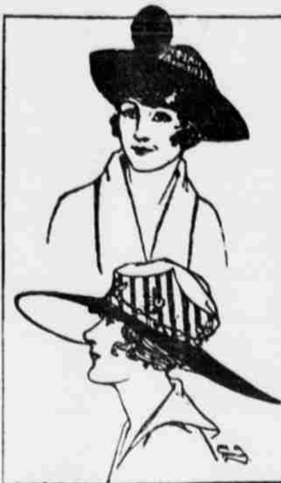
Hats That May Be Made at Home.

Two charming hats, either of which might be fashioned by the home milliner, are illustrated here. The larger of the two hats has a brim of velvet and crown of soft felt embroidered in chenille in contrasting colors. The brim might be of black or dark brown and