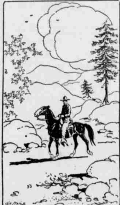
Rode Slowly Down the Valley.

unassigned message asking him to be at the railway depot at a certain hour, to meet the train. And he had gone, to find Jim Tremont waiting there. Jim was passing through on his way to California, he told him, and he had heard he was in that part of the country. Did Will know that his father was dead and he was the sole heir to five million dollars? He had better write home quickly, because everyone was searching for him, and he had only heard of his address by chance.