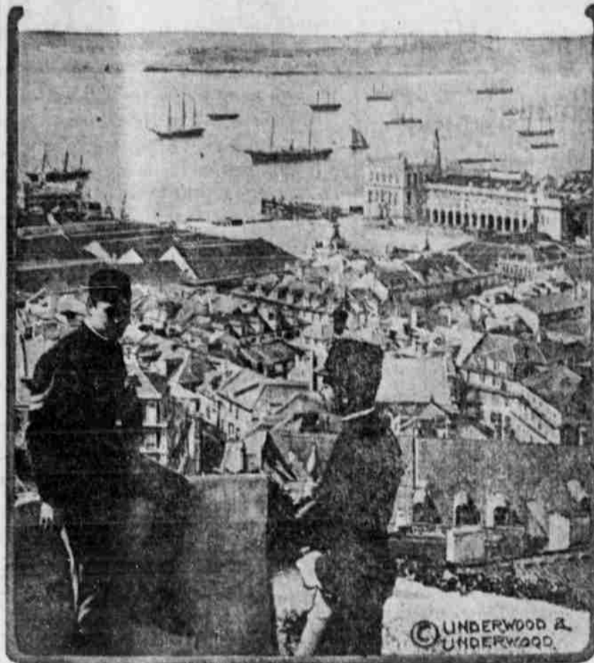
Lisbon's Beautiful Harbor.

PORTUGAL, the most recent nation to be drawn into the maelstrom of the European war, was once a part of the ancient Roman province of Lusitania, says a bulletin issued by the National Geographic society.