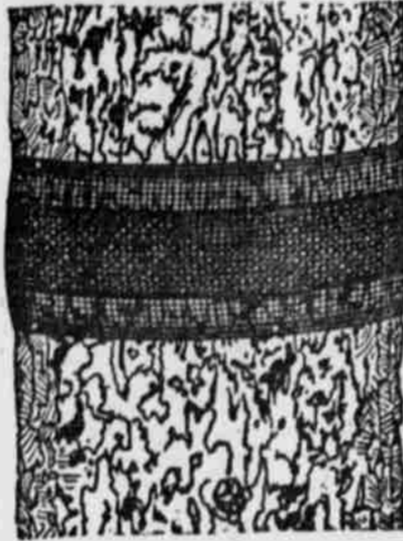
Codling Moth Trap.

The trap affords an attractive place for the larvae to spin their cocoons, and it prevents the escape of the moths after they emerge from these. The