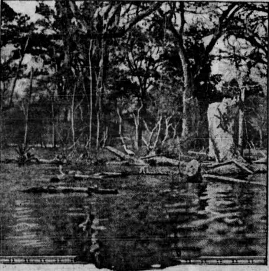
NEWLY FLOODED FORESTS ON THE RIO TRINIDAD