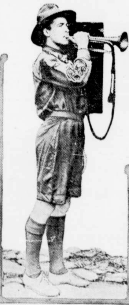
Scout Routine is Rigidly Observed at the Summer Gatherings.