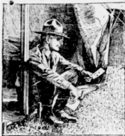
A Snapshot from Home will help Cheer the Soldier Boy at the Front.

Tillamook County is to raise $2000.00 for the relief of the suffering. Will you as community chairman, see that a committee is set to work right away on