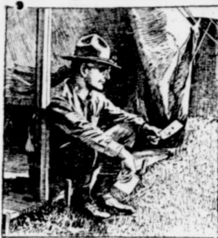
A Snapshot from Home will help Cheer the Soldier Boy at the Front.

The five government hospitals for leprosy in Japan at present contain about 1,500 patients, which is perhaps