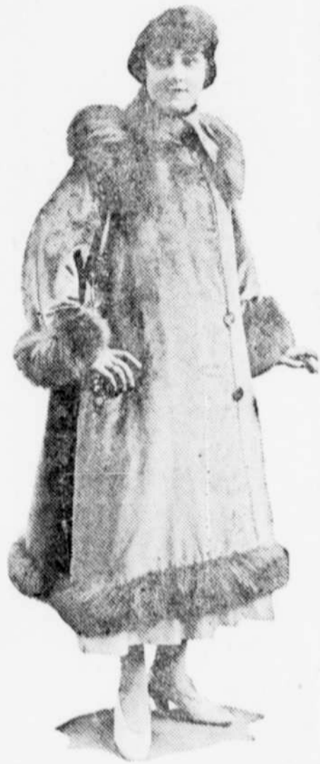
FUR TRIMMED EVENING COAT.

The chic and becoming evening coat for misses is featured in chiffon velvet in gold, French blue, coral, green, rose or black; full flaring model. The deep