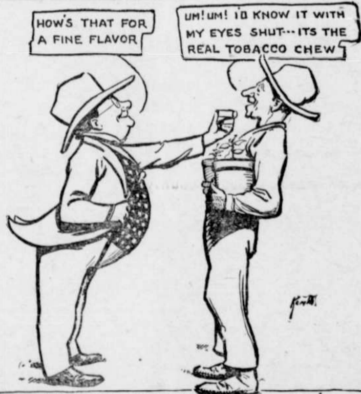
THE GOOD JUDGE AND THE FLORIST KNOW WHAT'S WHAT