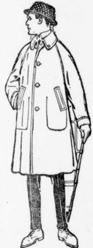
BRANDEGEE KINCAID & CO. CLOTHES.