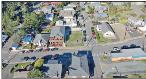
DOWNTOWN COMMERCIAL LOT IN MANZANITA $499,000