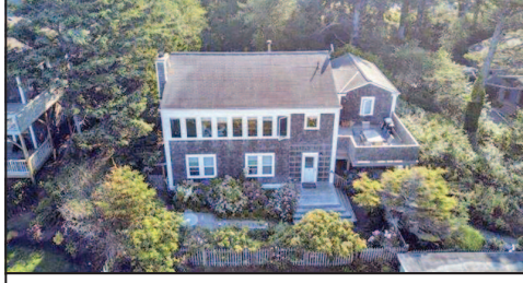
TERRIFIC ARCH CAPE OCEAN VIEW HOME $599,000