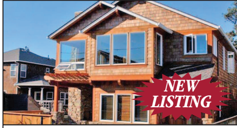
W. PRESIDENTIAL GEM! $1,449,000