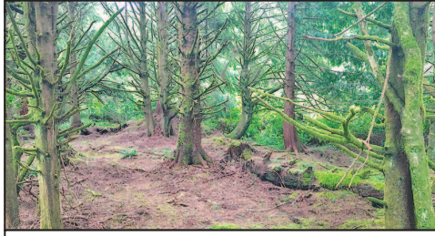
200' X 150' VACANT ARCH CAPE LOT $206,000