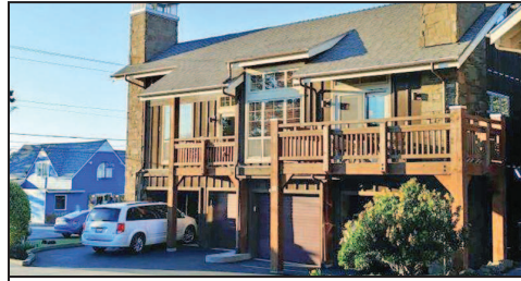
1/12TH SHARE CONDO UNITS A2-H & B $85,000-$90,000