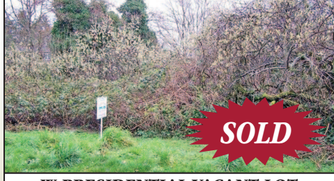
W PRESIDENTIAL VACANT LOT $305,000