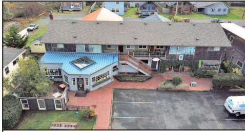
MANZANITA COMMERCIAL PROPERTY $1,350,000