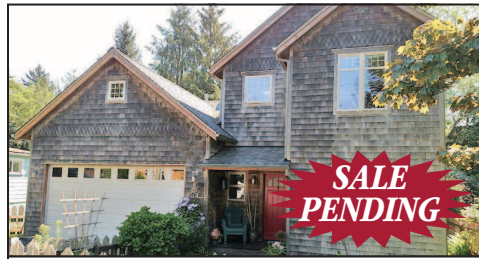
CUSTOM HOME TRANQUIL SETTING $639,000