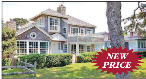
ONE OF A KIND OCEANFRONT $3,099,000