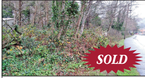
AFFORDABLE W PRESIDENTIAL VACANT LOT $299,000