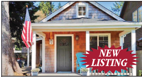
CUTEST COTTAGE IN CANNON BEACH $499,000