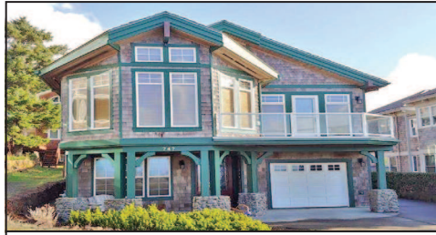
SUPERIOR OCEAN VIEWS & QUALITY $1,550,000