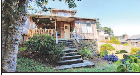
HEART OF DOWNTOWN $459,000