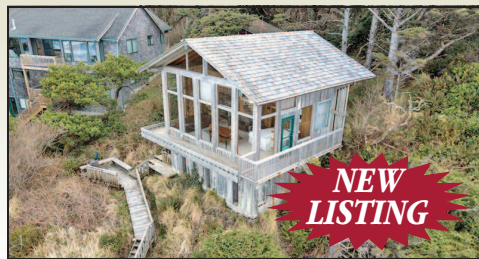
COZY OCEANFRONT BEACH CABIN $1,225,000