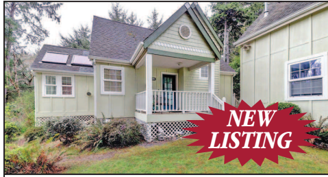
BEACH HOME W/GUEST STUDIO $639,000