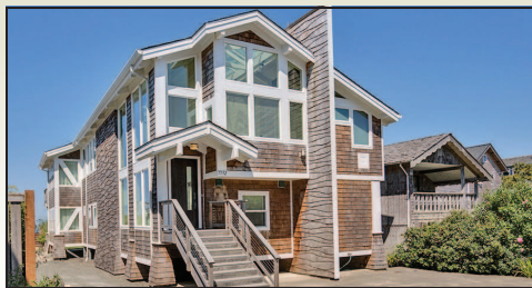
CUSTOM LAVISH CANNON BEACH OCEAN FRONT $2,590,000

MARCH 28 1:12 a.m., 3700 block Pacific: An assault in the fourth degree is reported; a male subject is arrested for domestic assault.