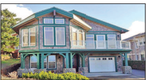
SUPERIOR OCEAN VIEWS & QUALITY $1,550,000