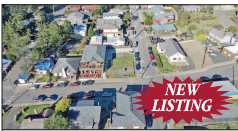
DOWNTOWN COMMERCIAL LOT IN MANZANITA $499,000