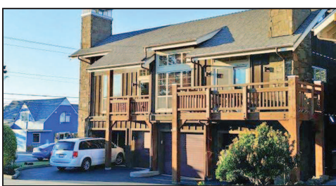
1/12TH SHARE CONDO UNIT A2-H $75,000