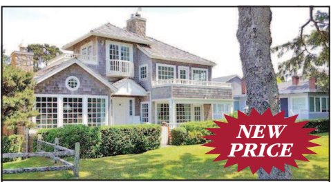
ONE OF A KIND OCEANFRONT $3,149,000