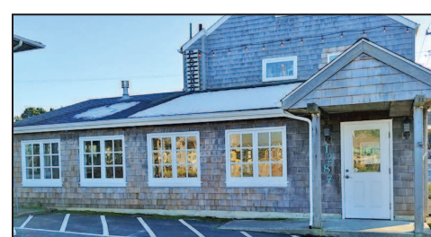
COMMERCIAL CONDO MID-TOWN $357,500