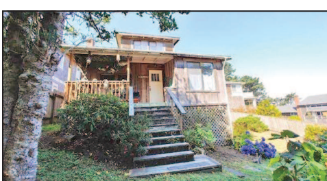
HEART OF DOWNTOWN $459,000