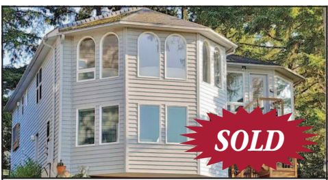
STUNNING VIEWS & RENTAL UNIT! $697,548