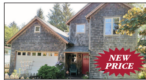
CUSTOM HOME TRANQUIL SETTING $639,000