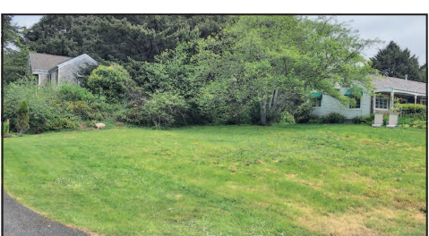
W KENAI OCEANVIEW LOT $485,000