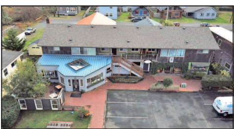
MANZANITA COMMERCIAL PROPERTY $1,350,000