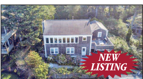
TERRIFIC ARCH CAPE OCEAN VIEW HOME $599,000