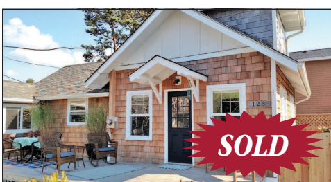
FAIRYTALE BEACH COTTAGE $499,000