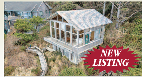
COZY OCEANFRONT BEACH CABIN $1,225,000