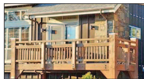
1/12TH SHARE CONDO UNIT A2-B $90,000