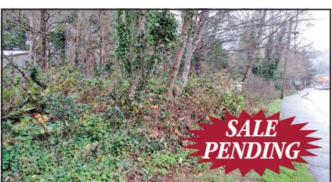
AFFORDABLE W PRESIDENTIAL VACANT LOT $299,000