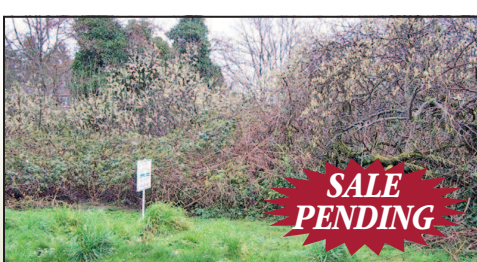
W PRESIDENTIAL VACANT LOT $305,000

296 N. Spruce St. • Cannon Beach • (503) 436-0451 www.duanejohnson.com All brokers listed with firm are licensed in the state of Oregon Active Members of RMLS & flexmls What is RMLS? As the Northwest's largest REALTOR®-owned Multiple Listing Service (MLS), RMLS serves approximately 10,000 Real Estate Professionals in over 2,200 offices licensed in Oregon and Washington.