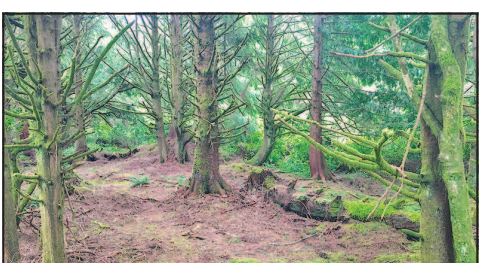
200' X 150' VACANT ARCH CAPE LOT $206,000