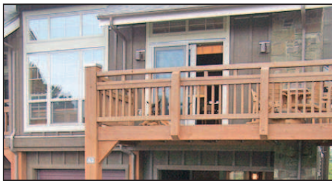
LODGES AT CANNON BEACH 3 SHARES $75,000 TO $90,000