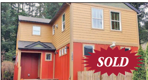
COMPLETELY REMODELED INSIDE & OUT $368,000