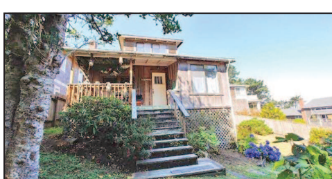
HEART OF DOWNTOWN $459,000