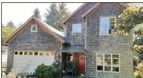
GREAT LOCATION $695,000