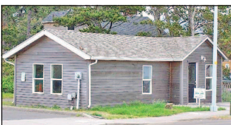
SEASIDE COMMERCIAL/RESIDENTIAL BUILDING $249,000