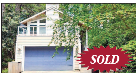
TRANQUIL SETTING $499,000