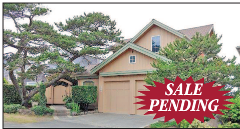
ELEGANT OCEANFRONT $1,995,000