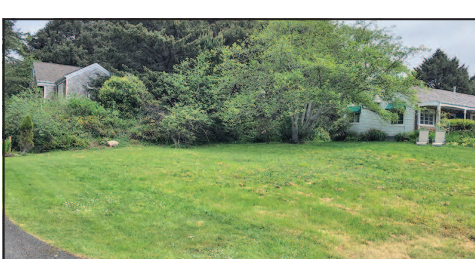
W KENAI OCEANVIEW LOT $485,000