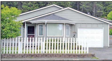
SWEET AFFORDABLE COTTAGE $375,000