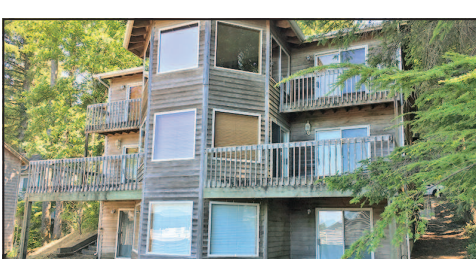
3 STORY CANNON BEACH WITH OCEAN VIEWS $579,500