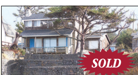
CANNON BEACH OCEANFRONT $1,499,000