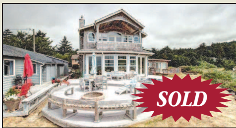
CANNON BEACH CUSTOM OCEAN FRONT $1,895,000