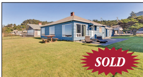
ARCH CAPE COTTAGE W/75' OF OCEANFRONT $1,029,000