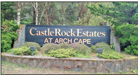
CASTLE ROCK ESTATE LOT# 12 $139,900