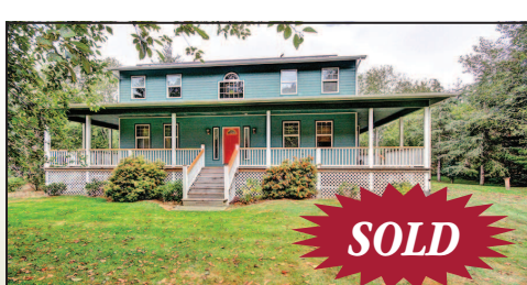
SPACIOUS NECANICUM RIVER FRONT SEASIDE $489,000

296 N. Spruce St. • Cannon Beach • (503) 436-0451 www.duanejohnson.com