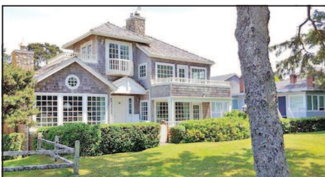
ONE OF A KIND OCEANFRONT $3,999,950