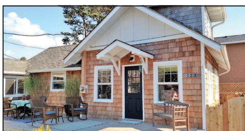
FAIRYTALE BEACH COTTAGE $499,000