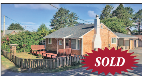
EAST PRESIDENTIAL ST COTTAGE $465,000