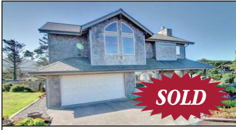
SWEEPING OCEAN VIEWS $819,000