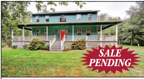
SPACIOUS NECANICUM RIVER FRONT SEASIDE $489,000