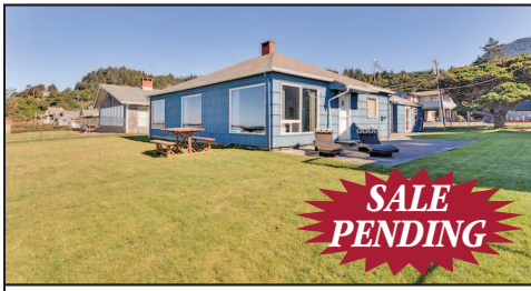
ARCH CAPE COTTAGE W/75' OF OCEANFRONT $1,029,000