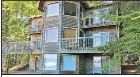
3 STORY CANNON BEACH WITH OCEAN VIEWS $579,500