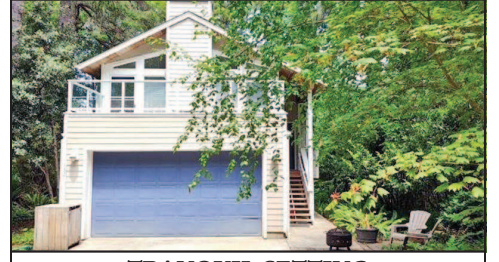
TRANQUIL SETTING $529,000