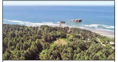
THREE OCEAN VIEW LOT'S $599,000