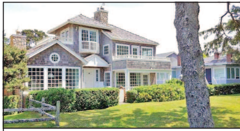
ONE OF A KIND OCEANFRONT $3,999,950