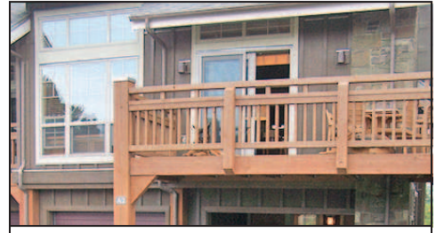
LODGES AT CANNON BEACH 5 SHARES $74,000 TO $90,000