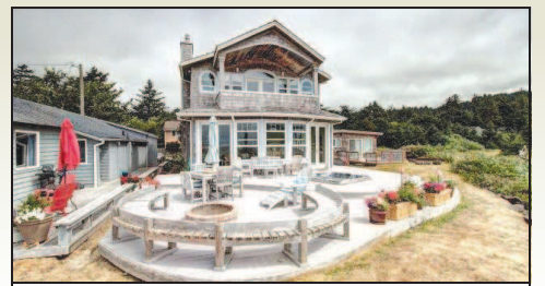
CANNON BEACH CUSTOM OCEAN FRONT $1,895,000