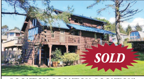
LOCATION, LOCATION, LOCATION! $489,000