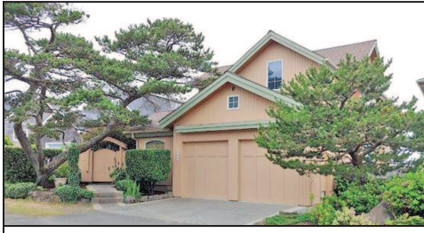
ELEGANT OCEANFRONT $2,100,000