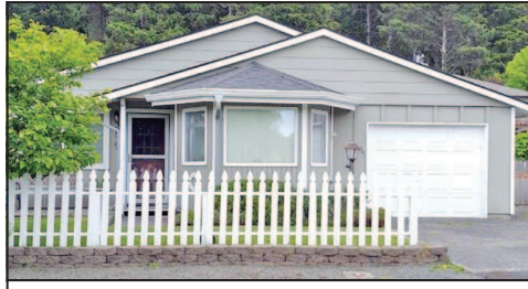
SWEET AFFORDABLE COTTAGE $375,000