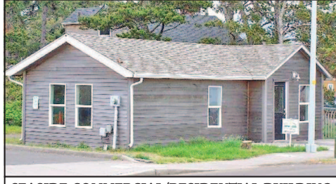
SEASIDE COMMERCIAL/RESIDENTIAL BUILDING $249,000