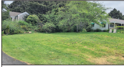
W KENAI OCEANVIEW LOT $485,000