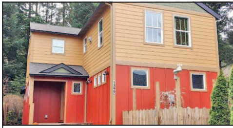
COMPLETELY REMODELED INSIDE & OUT $368,000