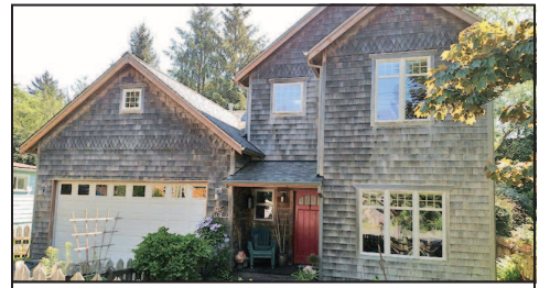
GREAT LOCATION $729,500