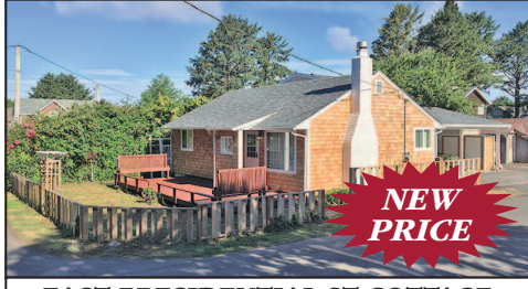
EAST PRESIDENTIAL ST COTTAGE $465,000