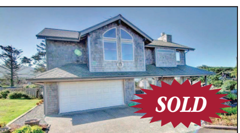
SWEEPING OCEAN VIEWS $819,000