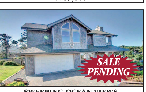
SWEEPING OCEAN VIEWS $819,000