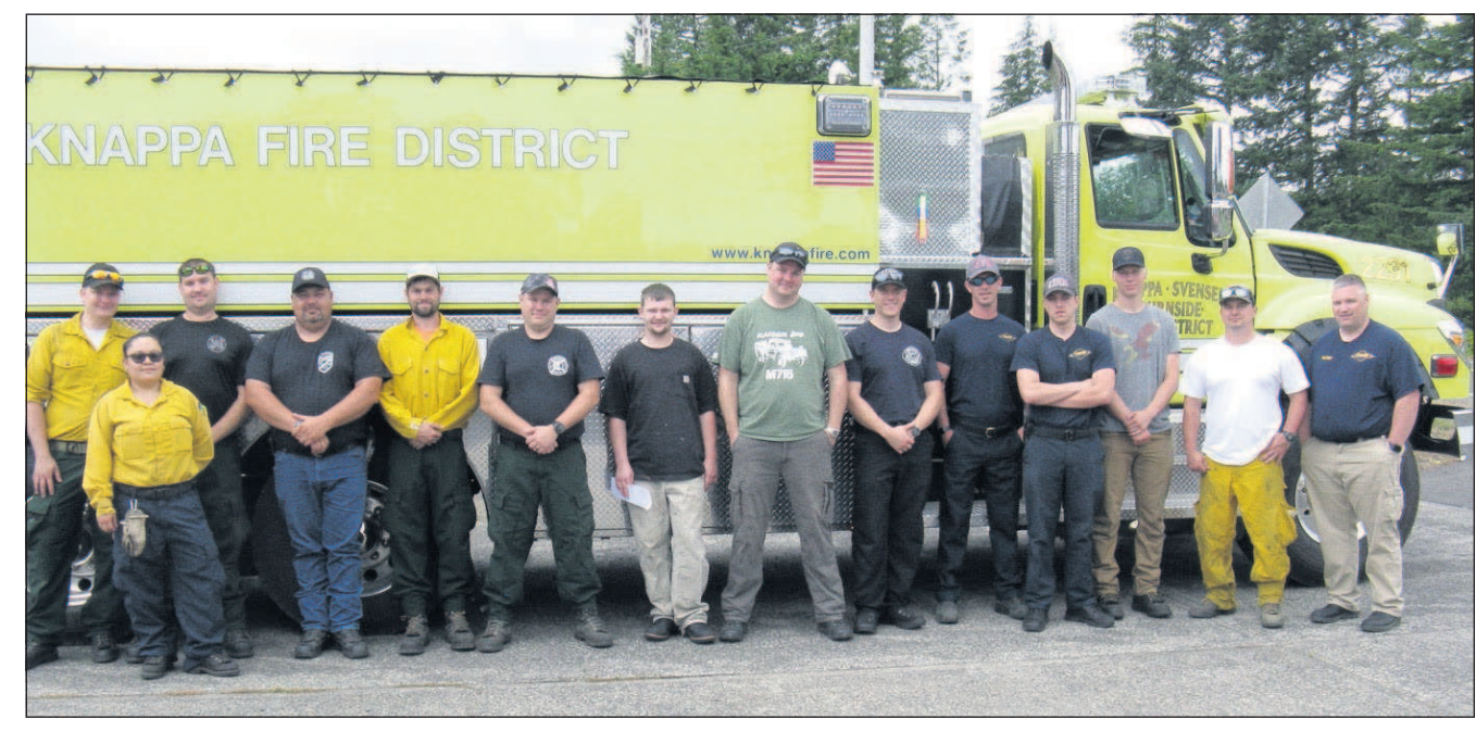
Local firefighters headed east earlier this month to help combat the Substation Fire in Sherman and Wasco counties.