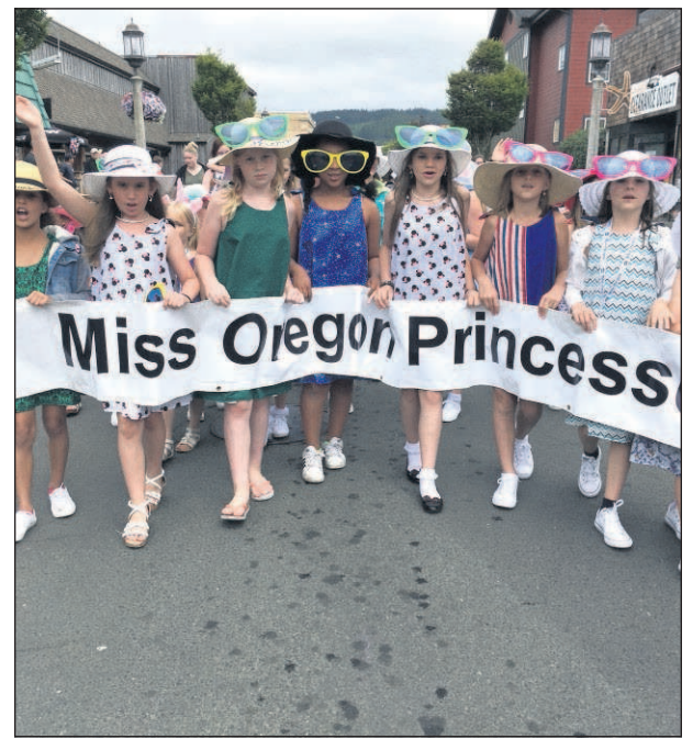
Whether future beauty queen or future scholars — or both — Miss Oregon Princesses strut their stuff.

“There was a bridge of compassion I felt between me and the people whose stories and experiences that, of course, I couldn’t compare my experiences with, but I found this whole country was still grieving 12 years after the genocide and it was very much under the surface. I came back from Rwanda wanting to tell these stories but wanting to tell these stories in fiction.”