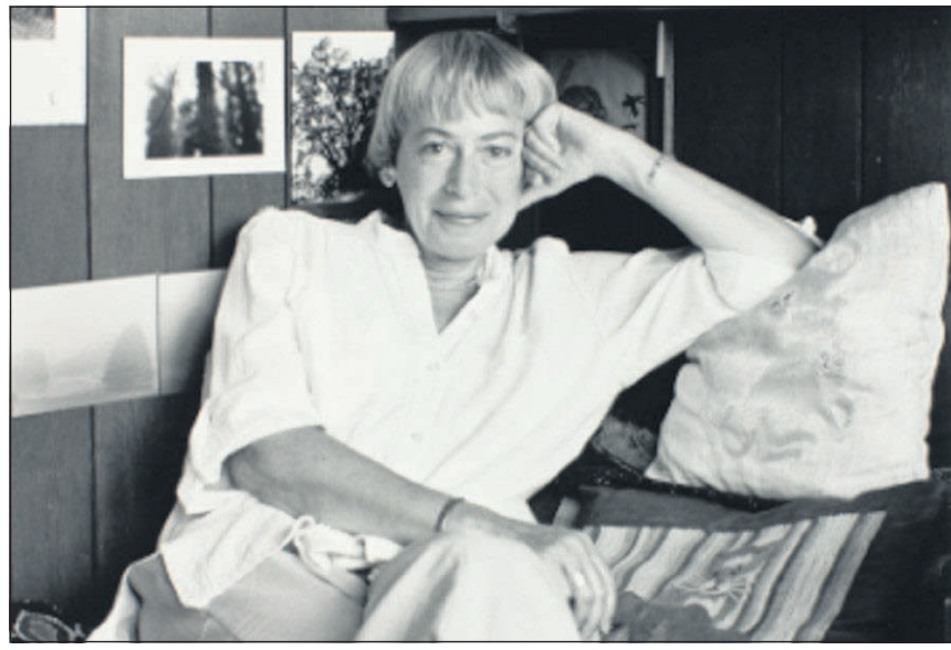
Ursula K. Le Guin

The two authors each retreated from fashionable literary salons: Roth lived and wrote in a wooded rural town in Connecticut 100 miles from New