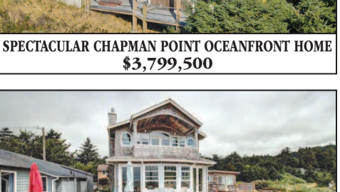
CANNON BEACH CUSTOM OCEAN FRONT $1,895,000