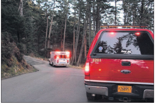
LEFT: A hiker with a broken leg was assisted to safety by Cannon Beach Fire and Rescue, Medix and Seasde Fire and Rescue. ABOVE: Rescue teams move to help an injured