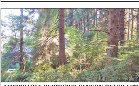
AFFORDABLE OVERSIZED CANNON BEACH LOT