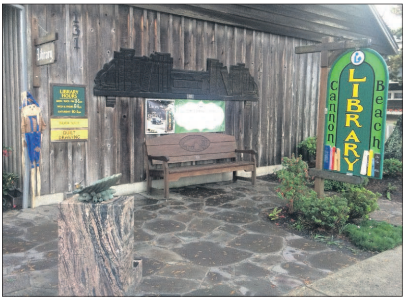
The Cannon Beach Library was founded in 1927.