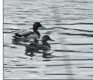
Mallards at Fort Clatsop.

Although leashed dogs are welcome at most of the park's outdoor programs, dogs are not allowed on birding walks.