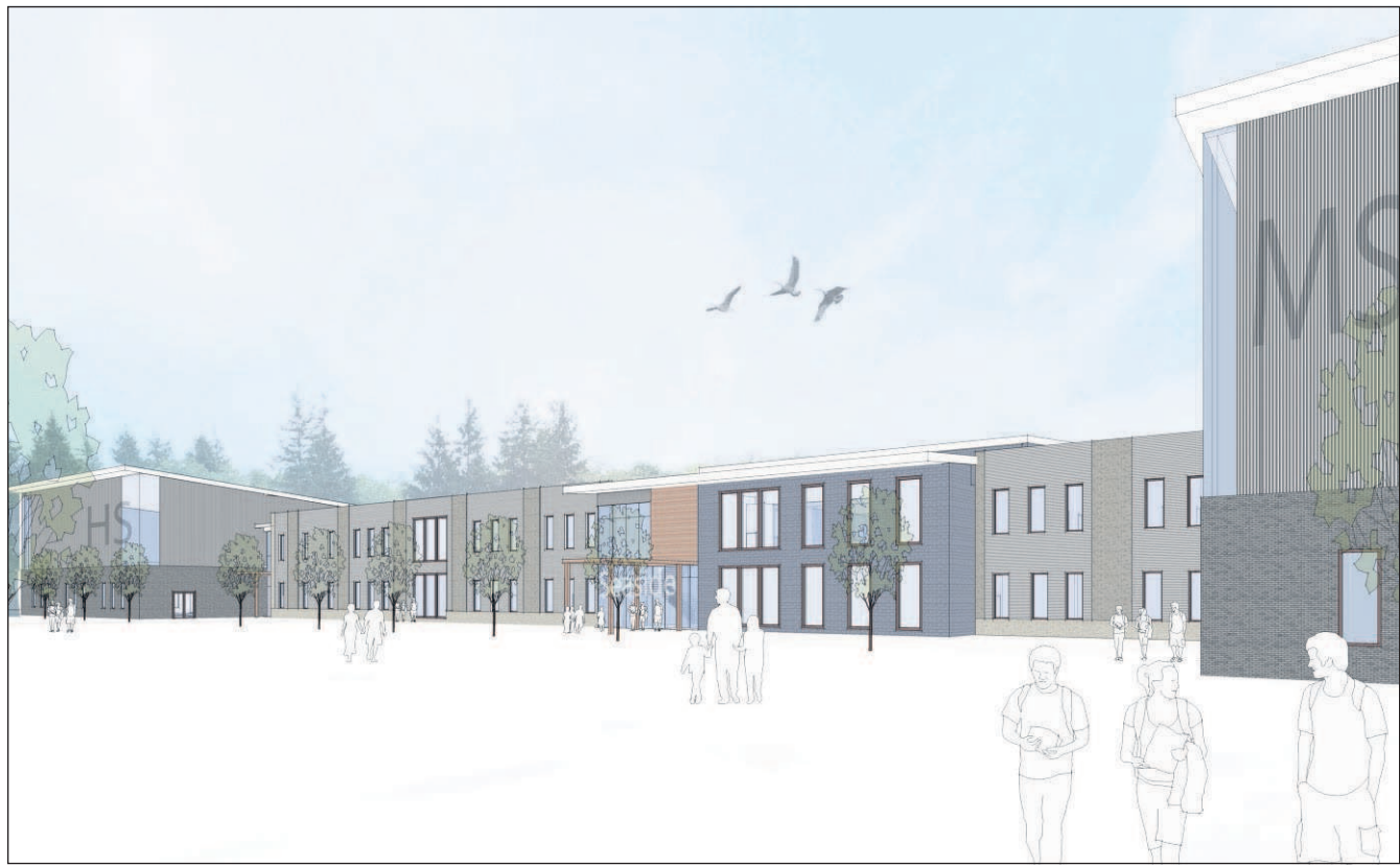
BRIC ARCHITECTURE INC.

A strategic planning team will be established to take data and start drafting the plan, she said.