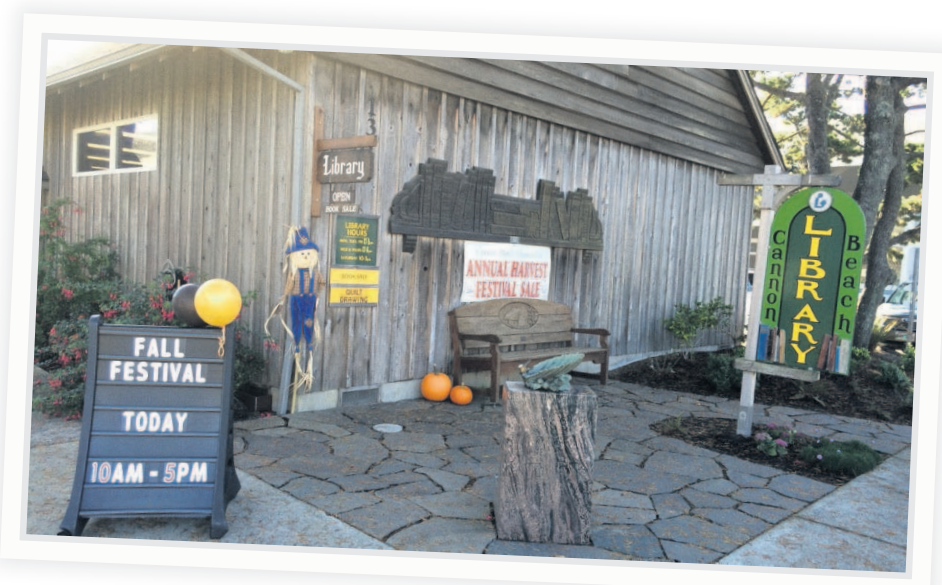
Last year's fall festival at Cannon Beach Library.