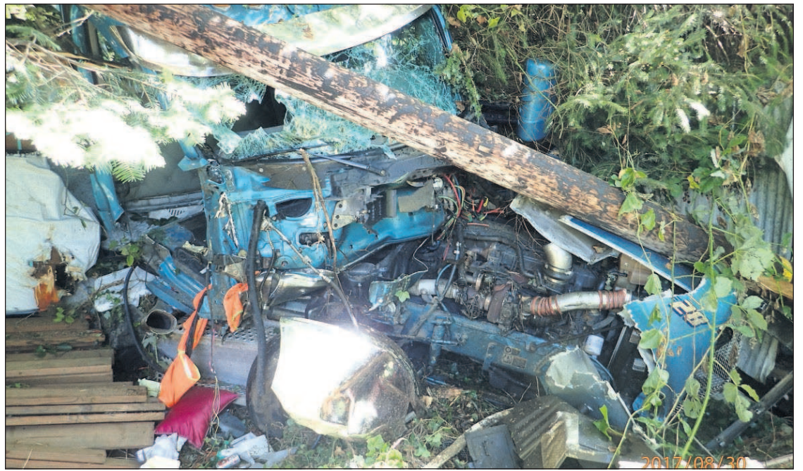
Damage to a truck after a hit-and-run accident near Wheeler on Wednesday, Aug. 30.

The suspect vehicle was described as a late 1970s, lifted, white or cream-colored, Chevy pickup truck, driven by a young