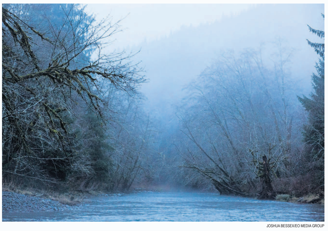
Fog is seen through the trees along North Fork Nehalem River.