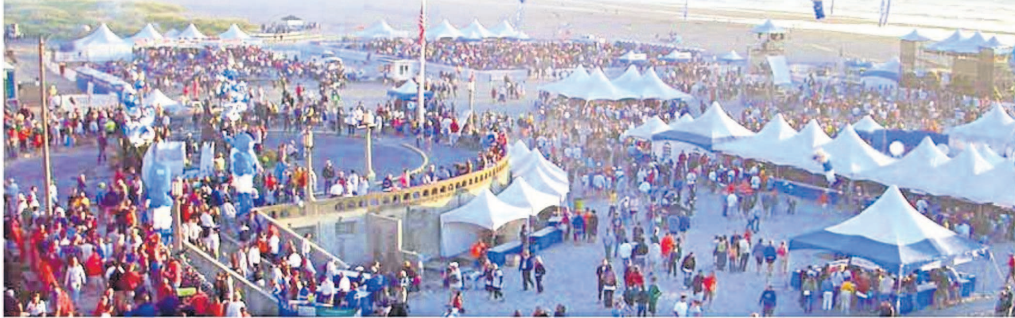
The Hood to Coast relay attracted an estimated 40,000 people to the beach in Seaside in 2014 to watch up to 12,600 runners from 1,050 teams cross the finish line.

"From talking to participants, volunteers, spectators and others every year, I know there's an incredible sense of camaraderie among those involved in the event, and that many special experiences and lasting memories have been created at Hood to Coast," Foote said.