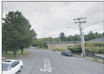
Spruce Drive is the only entrance to the new campus at this time, according to the document provided by Winterbrook Planning on behalf of the Seaside School District.

Traffic generated from the proposed school campus will have no significant impact on U.S. Highway 101. The cities of Seaside, Gearhart