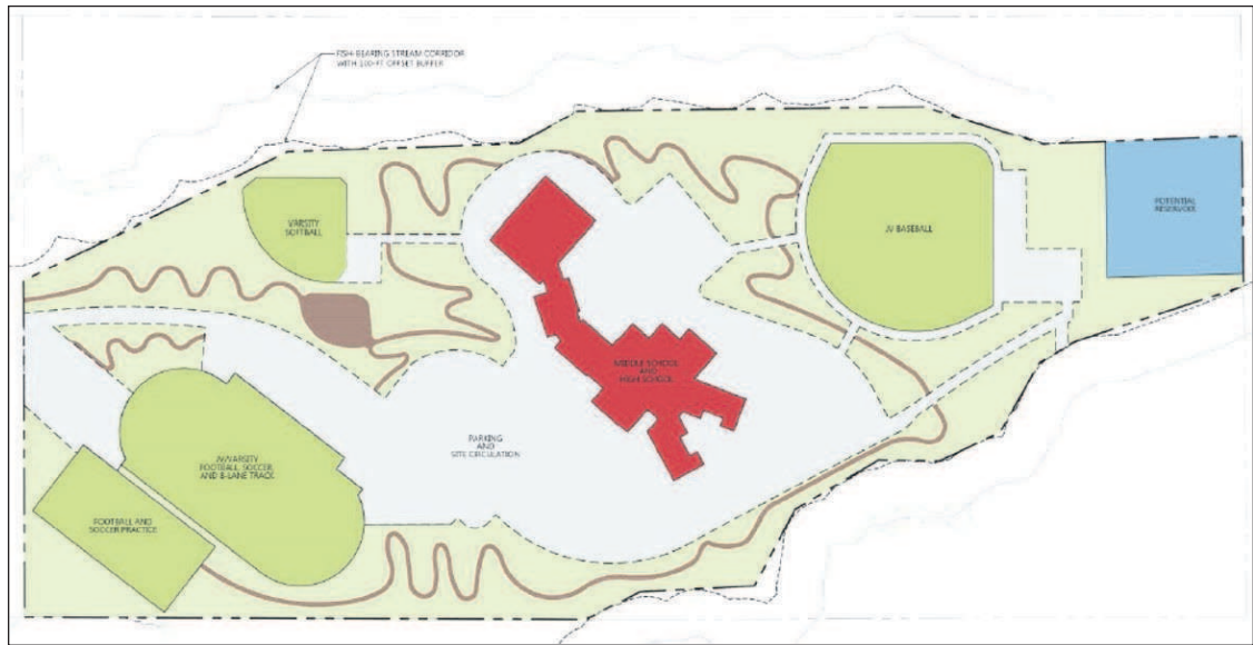
Preliminary map of the Seaside campus plan.

Analysis by Winterbrook Planning, with relevant background information provided by the Seaside School District, confirmed what the district had determined in 2009