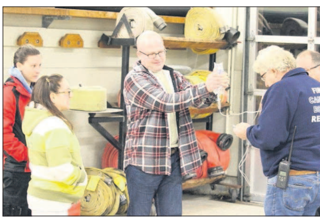
CANNON BEACH FIRE AND RESCUE

"There are pieces that we're already doing to help supplement the core that we