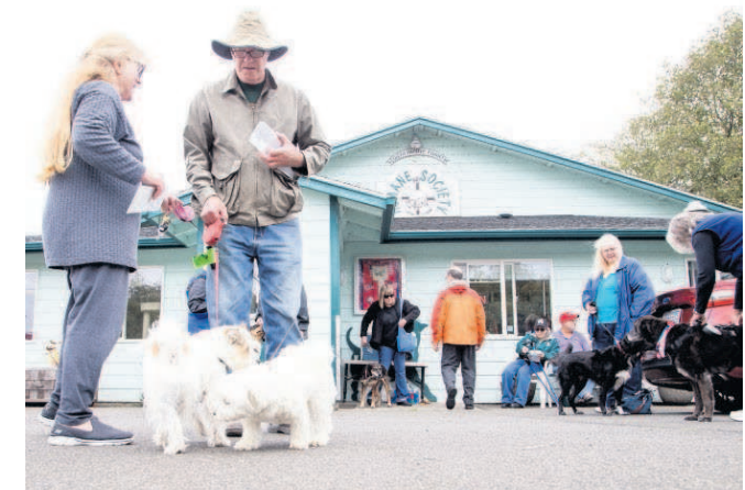
The South Pacific County Humane Society in Long Beach will hold an open house, raffles and children's activities on Oct. 29.

The BIG Raffle will take place at noon at the shelter annex. Grand prizes include: $1,500 cash, $750 cash, a $500 gift card, and a $250 gift card. Raffle ticket holders do not have to be present to win.