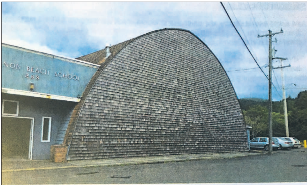
Exterior view of the Gymnasium from the Southwest

"We know very roughly what it would potentially