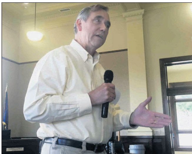
U.S. Sen. Jeff Merkley, D-Ore., speaks at a town hall event Wednesday in the Judge Guy Boyington Building in Astoria.

Merkley touched on other controversial issues, including the Trans-Pacific Partnership, a proposed trade deal among