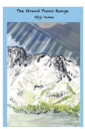
"The Grand Piano Range" by Sibyl James.

good bars where a barmaid "shares Wild Turkey on the house" and a neighbor is the guy who takes your shift the