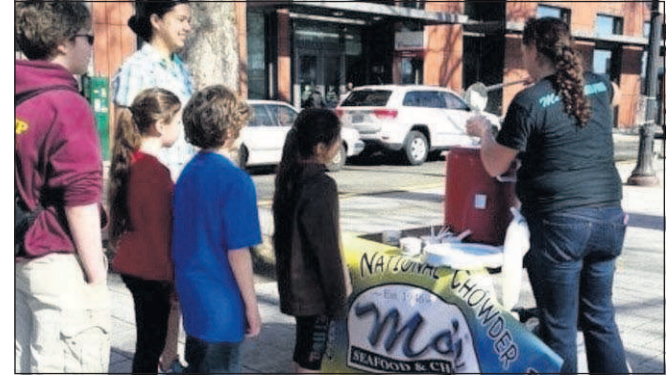
Employees from Mo's Cannon Beach location hit Portland to celebrate Mo's 70th anniversary.

"We have this unbelievably beautiful resource that people want to see," Nelson said of Oregon's marine reserves. "How can we let people in, but still make sure areas are protected?"