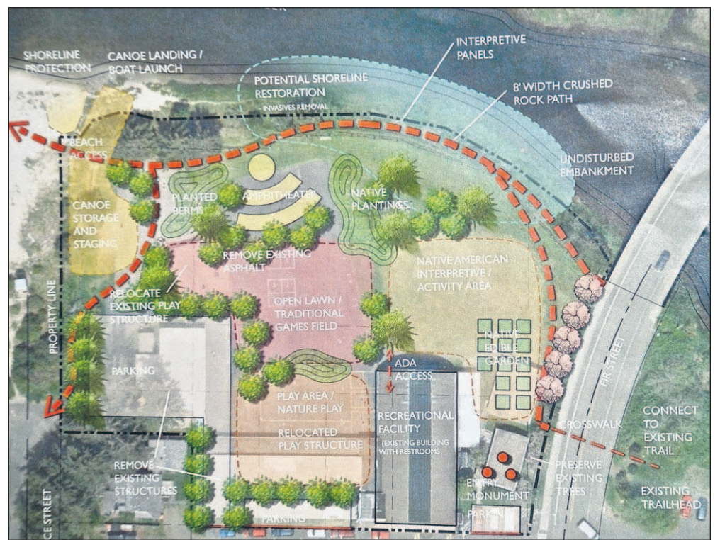
A proposed design of a Clatsop-Nehalem interpretive center shows the elements planned for the former Cannon Beach Elementary School property. Ecola Creek is to the north, and Beaver Street is to the south.