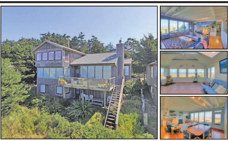
524 N. Ash Street, Cannon Beach • $1,895,000

Rare oceanfront vintage style cottage, designed by renown NW architect John Storrs, and located in the coveted north end of Cannon Beach. Open floor plan and expansive windows take advantage of views of the ocean and Haystock Rock. Hardwood floors throughout the main level, cedar sauna and jetted tub. Large art studio upstairs can easily be converted to a master suite with stunning ocean vistas.