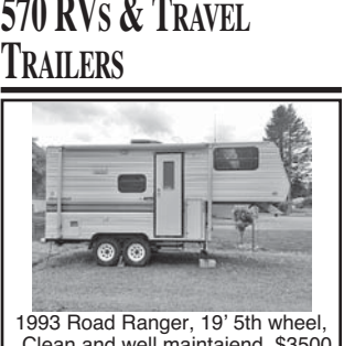
1993 Road Ranger, 19' 5th wheel, Clean and well maintaind. $3500. (503)298-9353