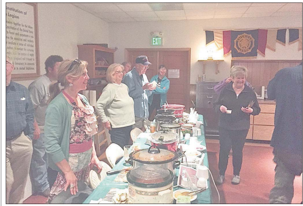
Chili Cook-off contestants prepare to be judged at the March 28 event in Cannon Beach.