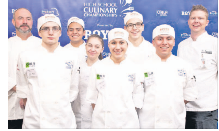
SUBMITTED BY LORI LITTLE

The Oregon Pro-Start state competition is the "capstone" of