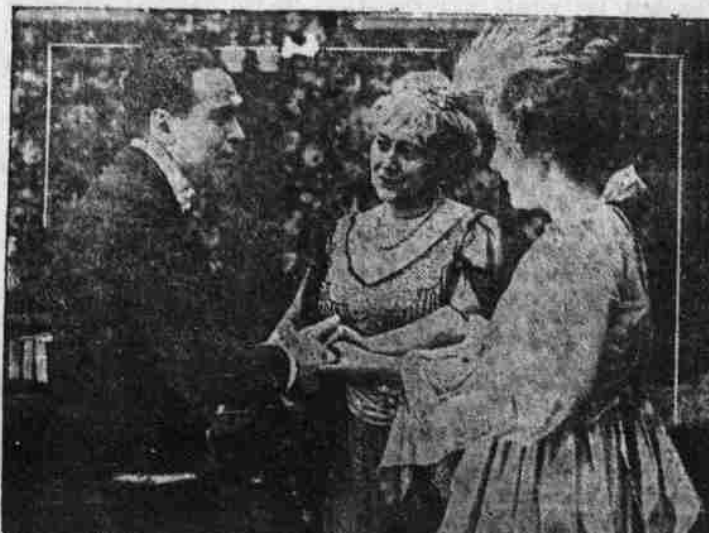
DOUGLAS FAIRBANKS IN SCENE FROM TRIANGLE PLAY, "FLIRTING WITH FATE"