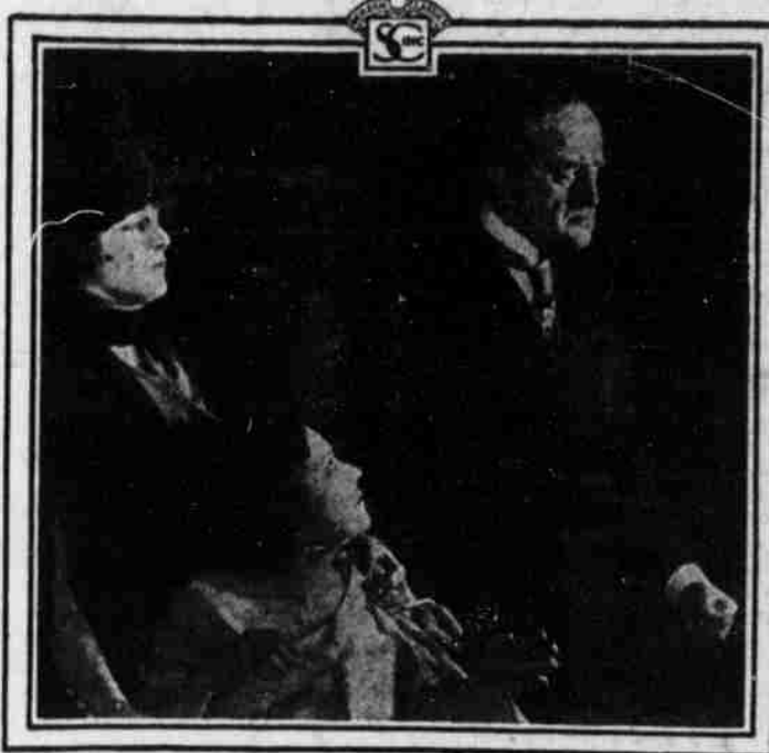
"TO HELL WITH THE KAISER"

Decency's Challenge to the Hohenzollerns